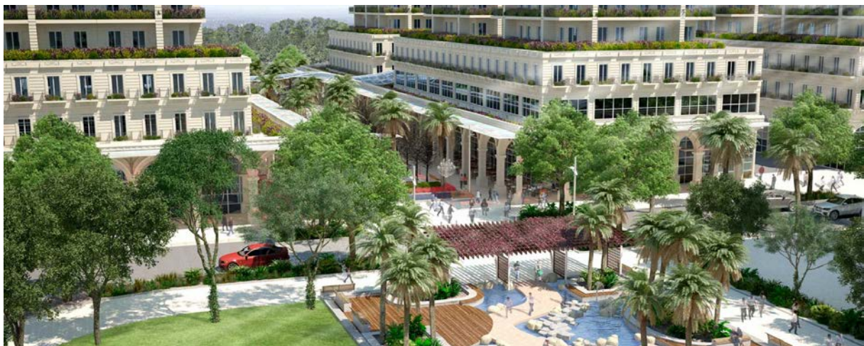
Proposed Middleton Grange Town Centre

The development provides an exciting opportunity where densities and activity will generate demand for high quality public transport services.